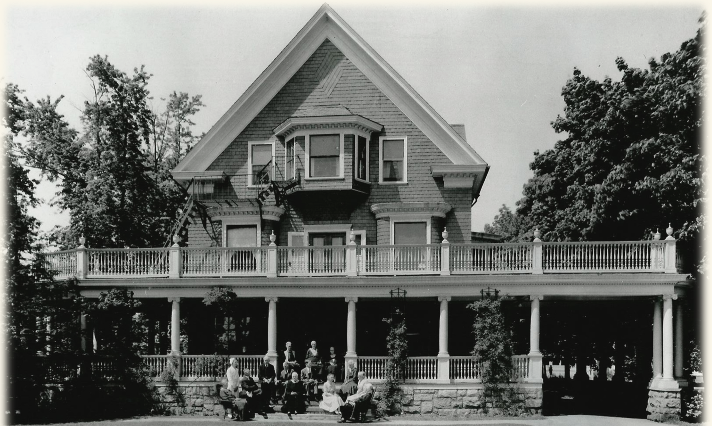
Scandinavian Old People's Home

Please support our “Enhanced Annual Appeal” for 2023!